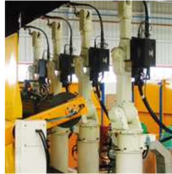
Robot manufacturers and system integrators