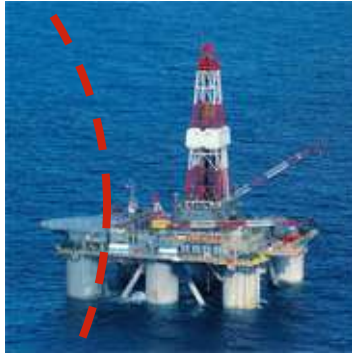
Shipbuilding and offshore