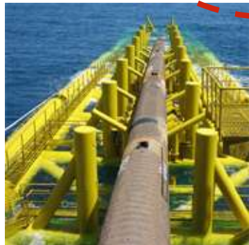
Pipeline construction and pipe manufacturers