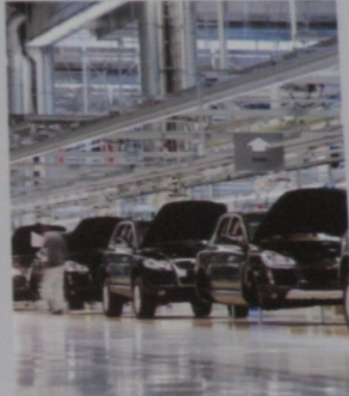
Produktion pro Arbeitstag