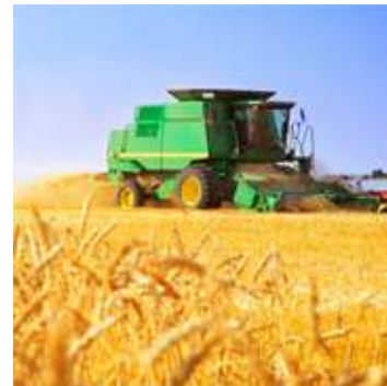
Commercial vehicles and agricultural machinery