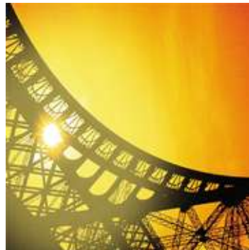
Steel, apparatus and mechanical engineering