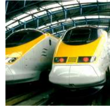
Rolling stock construction