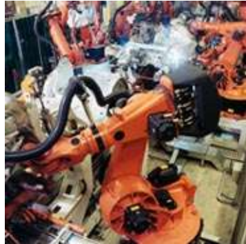
Automobile and component supply industry