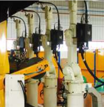
Robot manufacturers and system integrators