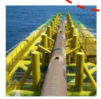
Pipeline construction and pipe manufacturers