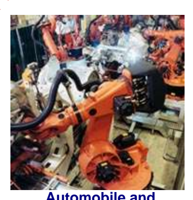
Automobile and component supply industry