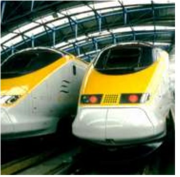
Rolling stock construction