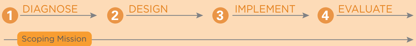
FIGURE 1. PPD LIFECYCLE

Before the design and implementation of a public-private dialogue mechanism, a project leader needs to consider whether there is a need for a new dialogue initiative and to what extent existing institutions can be leveraged.