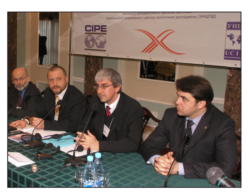
Ukrainian and international experts discuss economic and business reform priorities for Ukraine.

In the report, the facilitator should include all topics discussed, the method used to select priorities (voting, discussion, etc.), and the policy priorities that were accepted by the group. The report should be distributed to all participants. Participants should agree on all major points before the document is presented to the project coordinator.