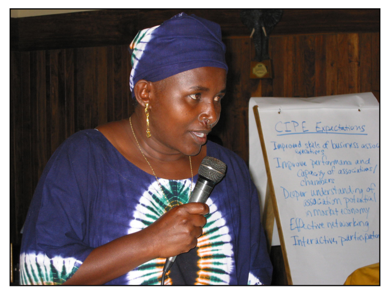
In Tanzania, CIPE works with entrepreneurs to foster leadership and advocacy skills.