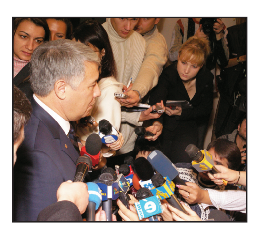
Former Prime Minister Yuri Yekhanurov speaks at a press conference held at the "Ukraine: Business and Economic Priorities" conference.

Step 1: Project coordinator and members of the task force incorporate feedback into the draft agenda.