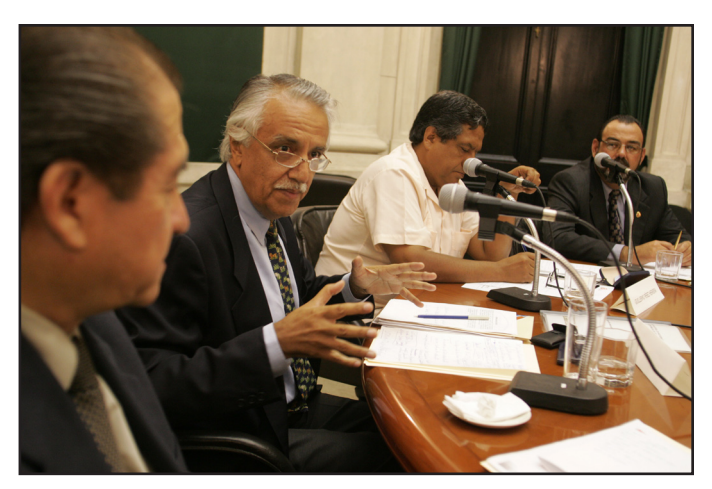
Businessmen in Peru form a working group to discuss labor reform issues that will be addressed in their national business agenda.