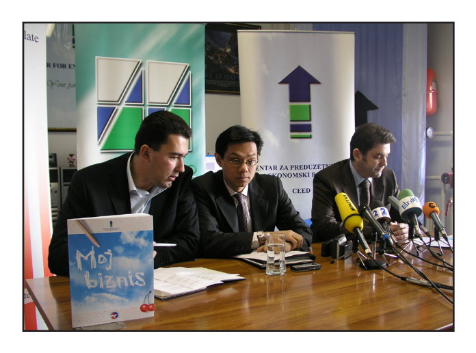
In Montenegro, business association representatives release materials aimed at promoting an understanding of basic economic issues.

The executive summary will be the first thing readers see. The executive summary should contain a very brief introduction and clearly identify the main obstacles to doing business and the specific recommended solutions. It should include a short conclusion and be no longer than four to six pages.