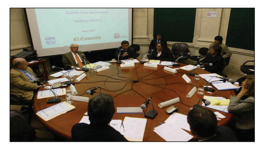
Peruvian business leaders hold an economic roundtable in Lima to begin the process of formulating a national business agenda.

Business associations in countries such as Malawi, Nigeria, Paraguay, Peru, Romania, Russia, Montenegro, and the United States have used NBAs to help enact much-needed political and economic reforms. It is a vehicle that can offer solutions to help address problems of corruption, the informal sector, and overregulation.