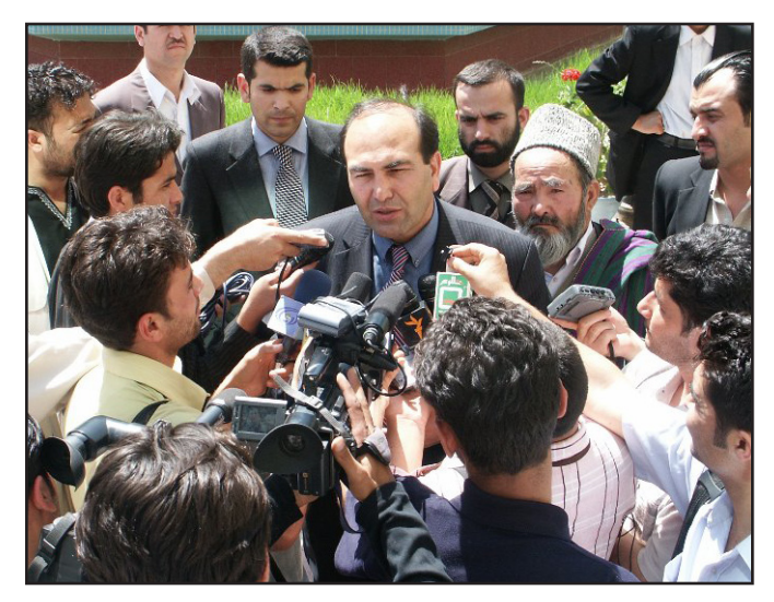
The Chairman of the Afghanistan International Chamber of Commerce responds to questions from the press at a National Advocacy Tour event.

Step 6: Task force writes a press release announcing the event and distributes the executive summary to journalists.